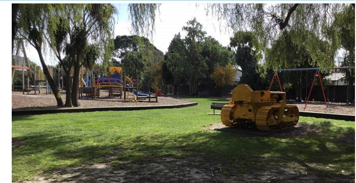
Harrington Park in Riccarton