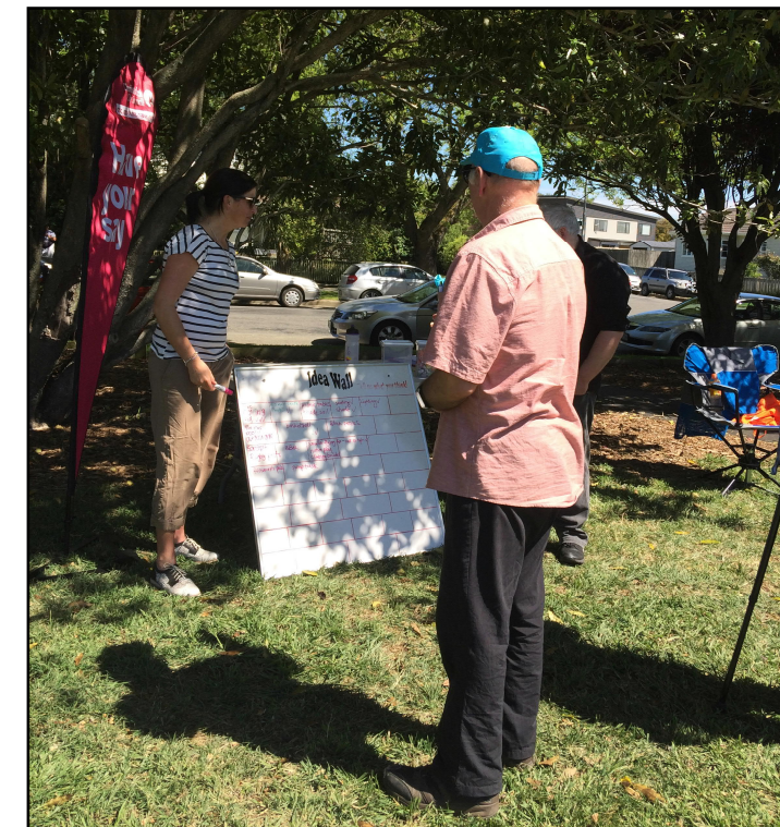
Collecting ideas at the Riccarton Community Day 2018

We would like to say a big thank you to those in the community that we talked to about this project at the Riccarton Community Day and who completed the survey for this project. This feedback has been invaluable in helping us to put this plan together. While the project budget does not allow us to include every idea, we have attempted to include as much as we can.