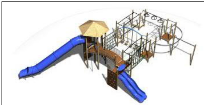
New modular play item