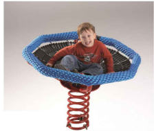
A HONEYCOMB SPRINGER