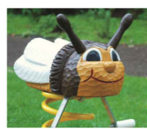
B WOBBLY WOOD BEE ROCKER