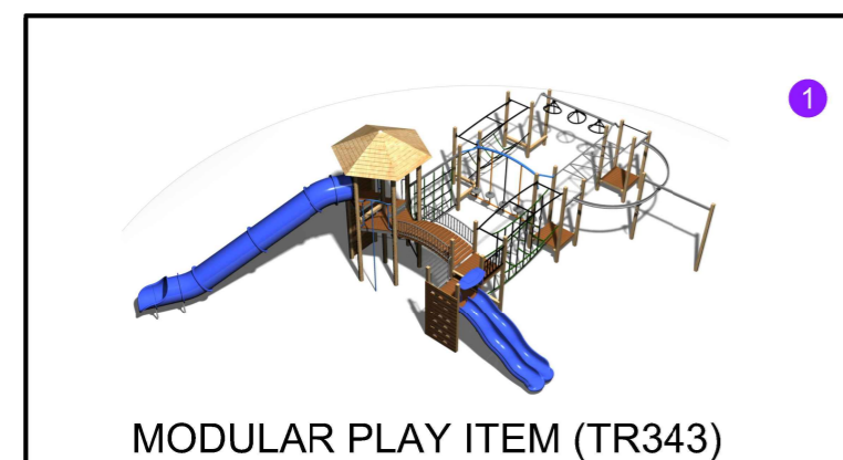
MODULAR PLAY ITEM (TR343)