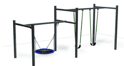
URBAN MEGA SWING WITH FLYING SAUCER