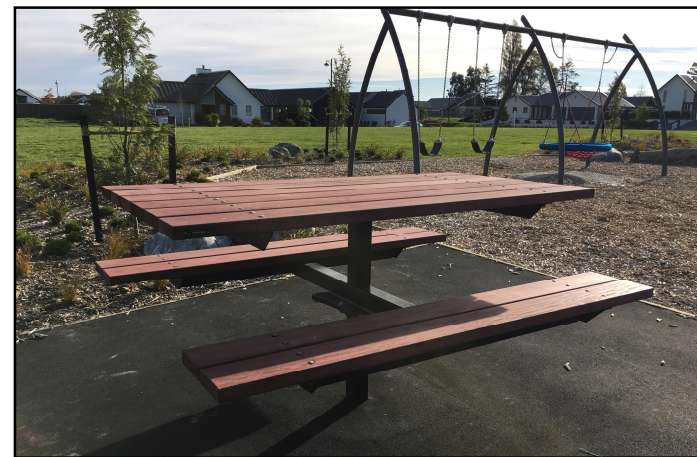
Example of an accessible picnic table

During our initial conversations with the community there were lots of comments about the lack of seating in the park. So the landscape plan includes two new wheelchair accessible picnic tables, three new park benches (with arm rests) and the relocation of one existing seat closer to the play spaces.