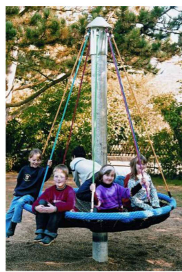
2.95m BIRDS NEST CAROUSEL