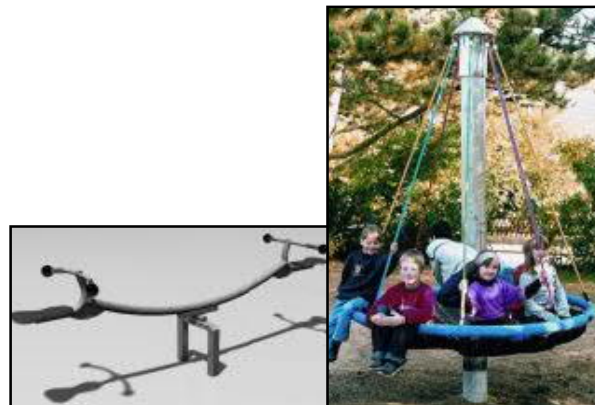
New single see-saw (left) and carousel (right)

The landscape plan also includes a new single see-saw and a new 2.95m birds nest carousel.