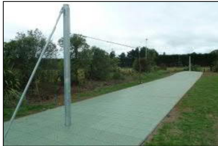
New flying fox being proposed

The existing flying fox will be removed, however part of the existing mound will remain to provide height for the new flying fox. The new flying fox will be 30 m single traveller flying fox.