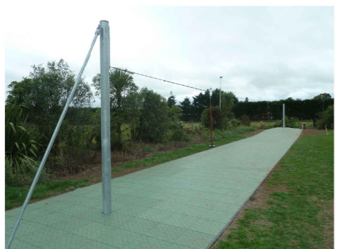
30m SINGLE TRAVELLER / FLYING FOX