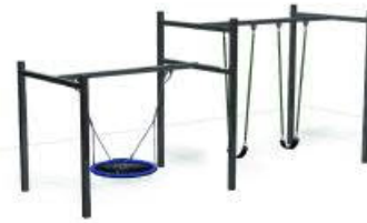
Replacement swing set

The draft landscape plan includes a swing set to replace the existing swing set in the park. This set includes two strap swings and a flying saucer swing. This swing set is higher than a usual frame so can also be used by older youth and young adults.