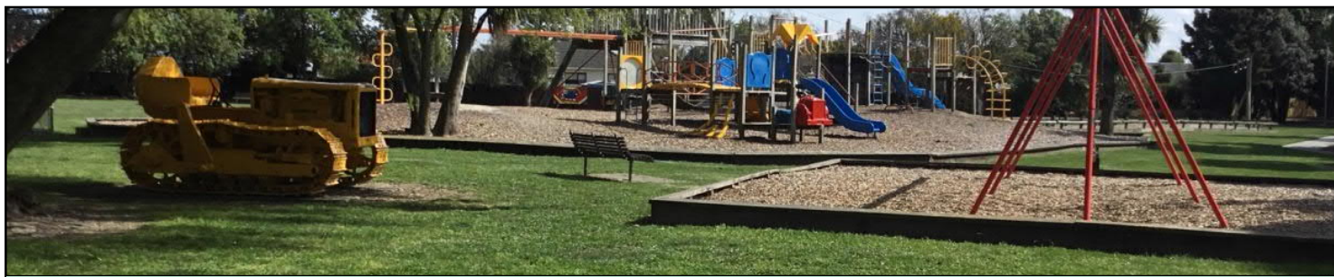
Harrington Park play space