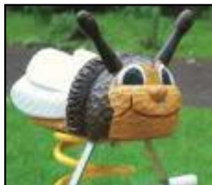
Honeycomb springer (left) and wobbly wood bee rocker (right)